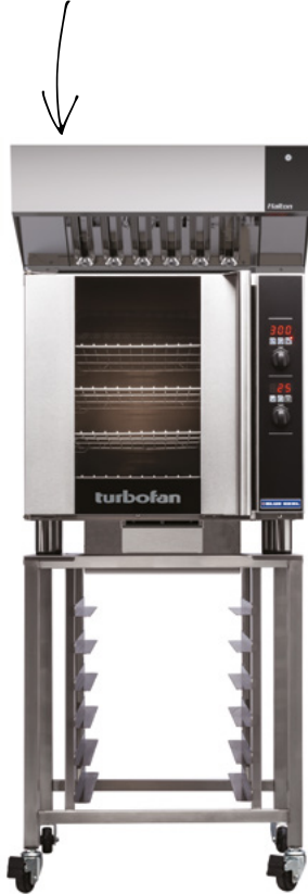
VH32 / E32D4 / SK32

Compatible with E32D4 / E32T4 convection ovens