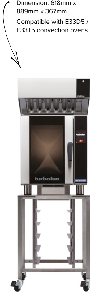
VH33 / E33T5 / SK33-VH

Compatible with E33D5 / E33T5 convection ovens