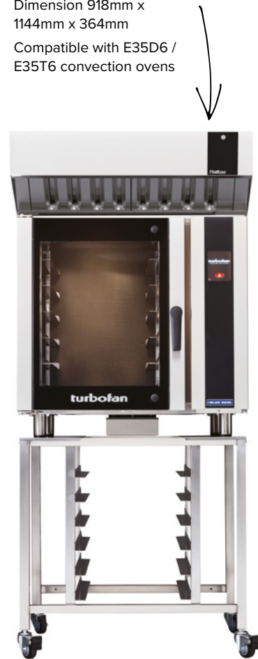
VH35 / E35T6 / SK35

Compatible with E35D6 / E35T6 convection ovens